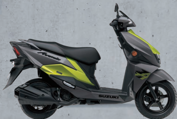
Metallic Matt Fibroin Grey / Metallic Lush Green (CC8)