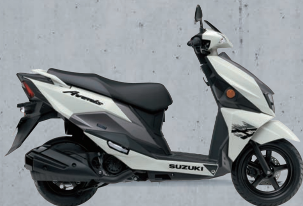
Pearl Mirage White / Metallic Matt Fibroin Grey (A8D)