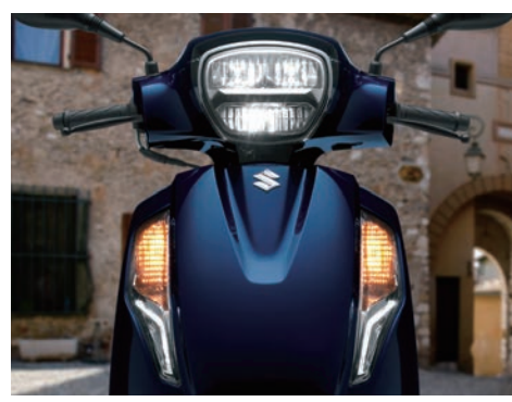
LED Headlight and LED Position Lights The bright LED headlight helps you see the road ahead better at night, and its bright chrome surround lends a premium touch to the Address 125's classic scooter appeal. LED position lights feature a sharp vertical design that creates a signature look. These LED lights bring the added benefit of durability and low power consumption.

Experience the timeless joy and exhilaration of two-wheeled urban freedom. Enjoy the stylish beauty of curvaceous form punctuated by attractive body lines and chrome-plated accents. Much more than just a practical, fuel-efficient scooter that delivers satisfying and responsive performance you will find ideal for everyday use, the Address 125 lets you make a statement about who you are and where you like to go.