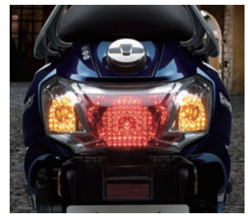
Rear combination light The rear combination light, featuring integrated turn signals, highlights the attractive appearance of the tail design.